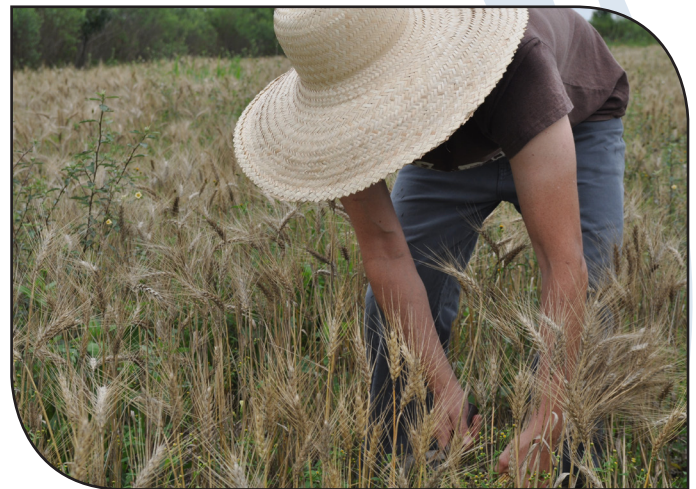
Family farming and agroecology - Brazil

Smallholders have always had to develop strategies to face the vagaries of climate and to manage sometimes difficult agricultural conditions, and have succeeded in doing so. The scale and speed of climate change are such, however, that it is now urgent and essential for the international community to provide far more support to family farmers in favour of innovation and greater investment in the more resilient types of agriculture.