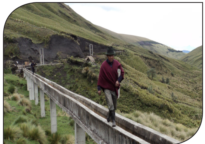
Irrigation system in the Andes - Ecuador

all target industrial farming; this must be made a priority in the Convention’s Annex 1 countries as well as in emerging countries.