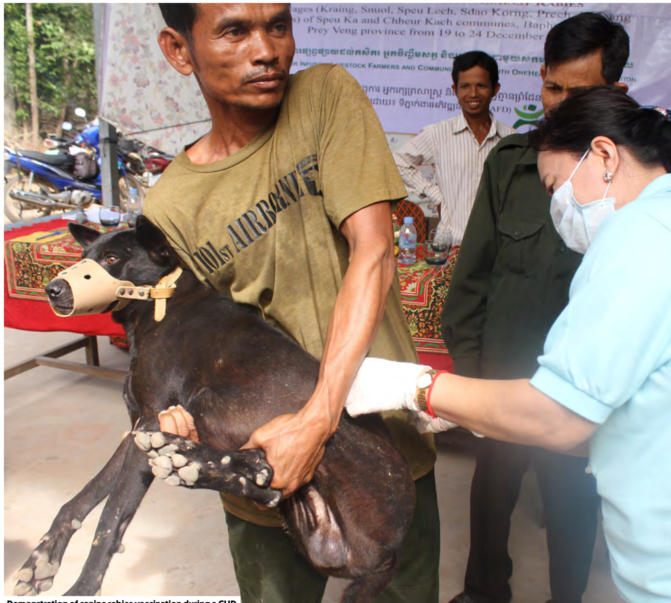
Demonstration of canine rabies vaccination during a CHD

For public health issues such as rabies prevention, success depends mainly on the development and implemen tation of national policies over which local actors have little control, which can lead to a certain frustration: the population is aware and understands the value of vaccinating dogs against rabies, but the availability of good quality vaccines and even the organization of vaccination campaigns are not guaranteed.